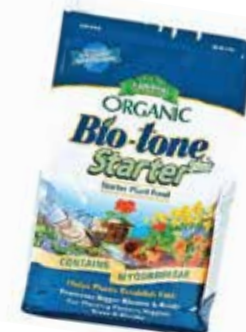
Espoma Bio-Tone Starter Plus