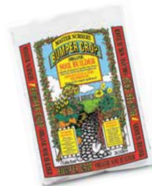
Master Nursery Bumper Crop

After digging your planting hole, create a 50/50 mix of excavated soil and Master Nursery Bumper Crop . Place your plant in the hole and begin backfilling around the root ball. Lightly tamp the soil every 2 - 3 inches and sprinkle with Espoma Bio-Tone Starter Plus . Continue to backfill your hole to the soil's original level. Use any excess soil to build a ring approximately 6 - 10 inches from the outside of the hole. This will help minimize water runoff and instead allow it to move slowly down to the root zone of the plant.