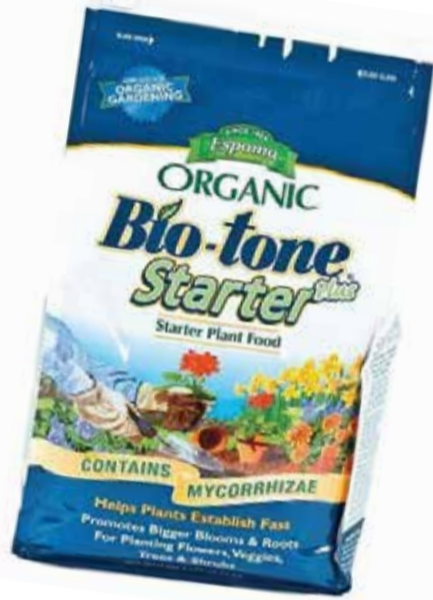
Espoma Bio- Tone Starter Plus