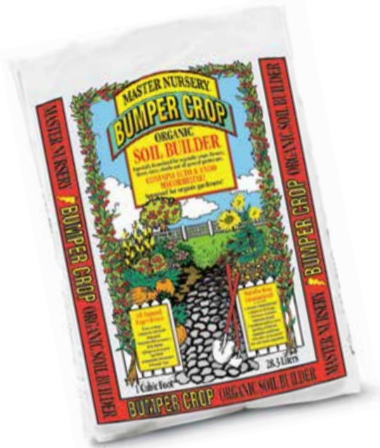
Master Nursery Bumper Crop

After digging your planting hole, create a 50/50 mix of excavated soil and Master Nursery Bumper Crop . Place your plant in the hole and begin backfilling around the root ball. Lightly tamp the soil every 2 - 3 inches and sprinkle with Espoma Bio-Tone Starter Plus . Continue to backfill your hole to the soil's original level. Use any excess soil to build a ring approximately 6 – 10 inches from the outside of the hole. This will help minimize water runoff and instead allow it to move slowly down to the root zone of the plant.