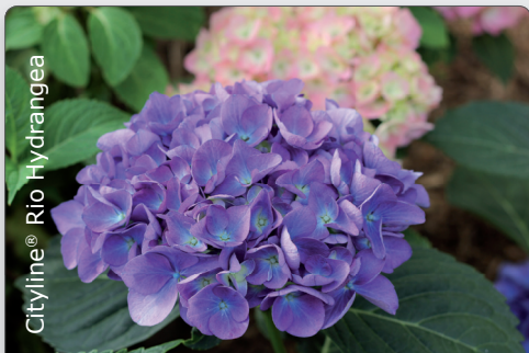
Cityline® Rio Hydrangea