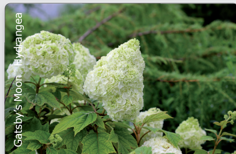
Gatsby's Moon™ Hydrangea

Proven Winners® varieties: Tuff Stuff™, Tiny Tuff Stuff™