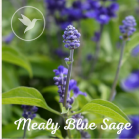
Mealy Blue Sage